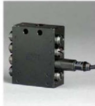
Primary Divider Valves With Flow Indication Proximity switch