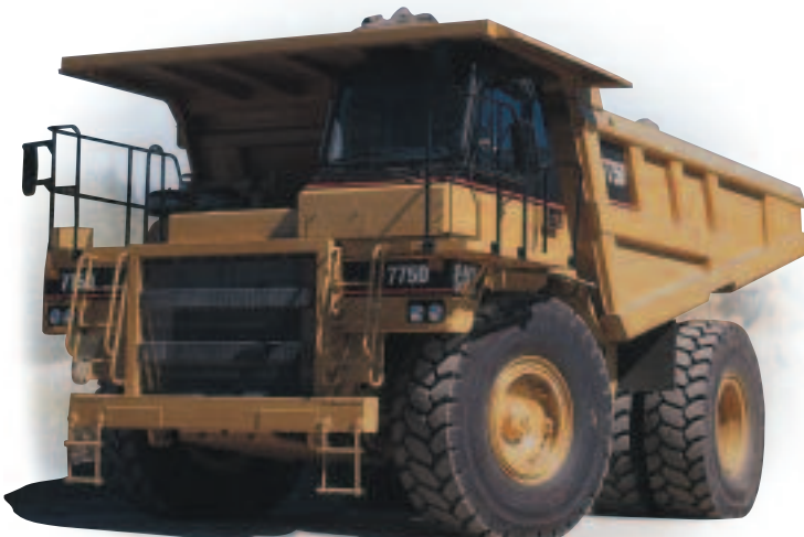
Dump trucks and ADT's