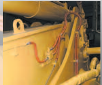
Pipe work protected with special heat shield shrouding