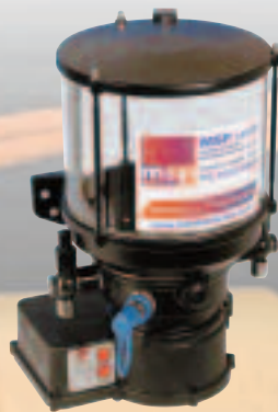
HDI Pump with 6kg or 8kg reservoirs with in-built fully adjustable programmable controller and external digital display