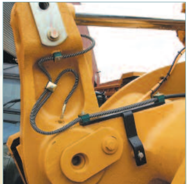
Protected heavy duty flexibles fitted to a CAT loading shovel