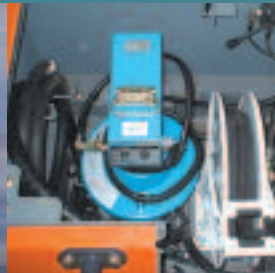
Pump and reel fitted within Excavator Compartment

The Hose reel kit comprises of an open hose reel with 10m (25ft) hose, swivel, trigger valve, 3 way ball valve and interconnecting hoses and fittings to and from the pump.