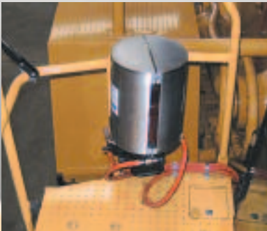
Pump reservoir fitted with metal protection shield